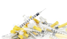
medical waste management